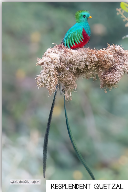
MARIO GÓRDOBA ©