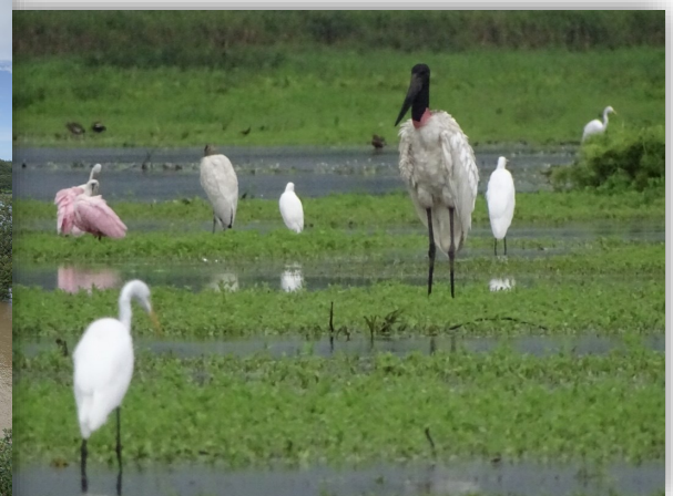
CAÑO NEGRO WETLANDS