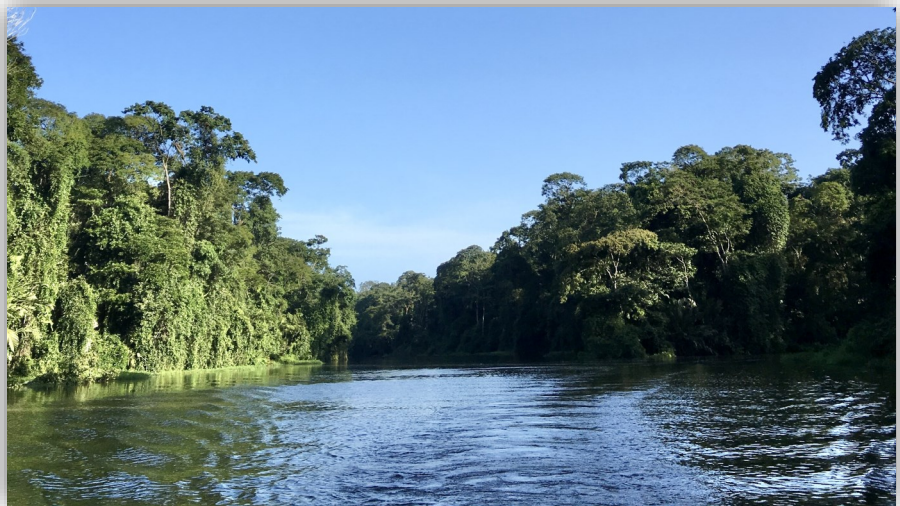
TORTUGUERO NATIONAL PARK

Overnight Evergreen Lodge (or similar) - BLD